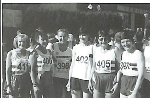
British Women prior to 10k start