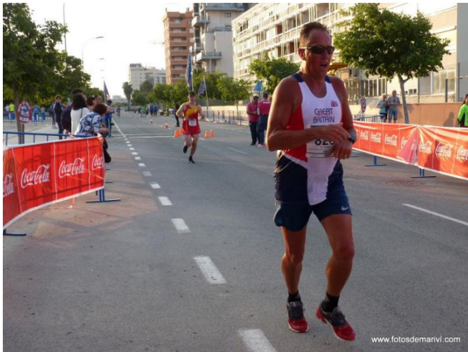
Finishing the 10km in a personal best

a few degrees which would help things no end. When our turn came the race itself went without a hitch with fantastic support from all nationalists and many shouts of 'come on GB' ringing in our ears and encouraging us on. One of my abiding memories was challenging runners from Italy, Germany, Spain, Finland and the great camaraderie from the other runners. We didn't win all the battles that confronted us but enough to feel satisfied that we had done ourselves proud.