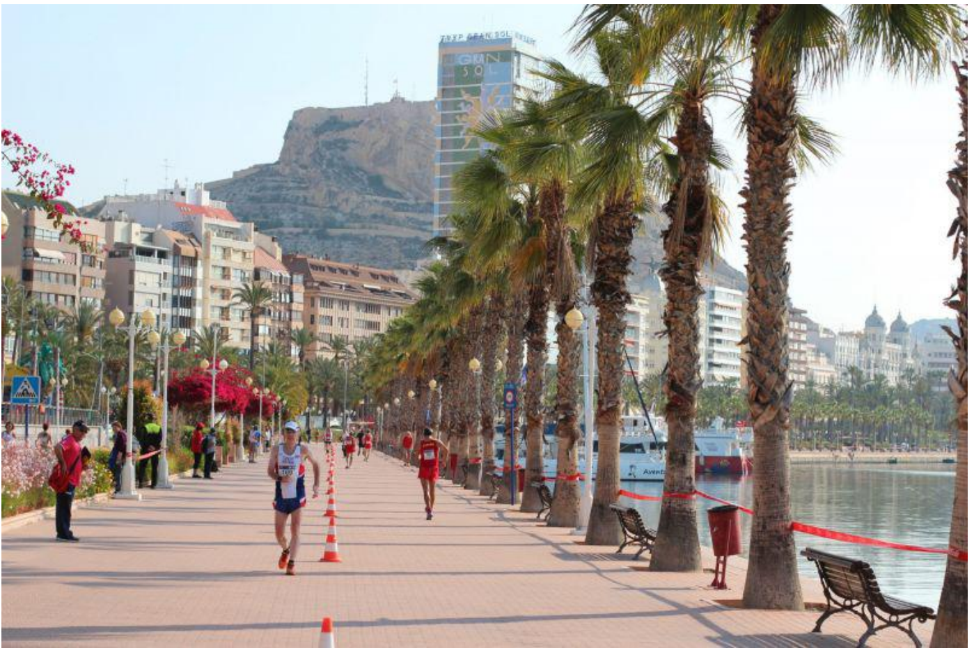
The Walks took place alongside the marina in Alicante