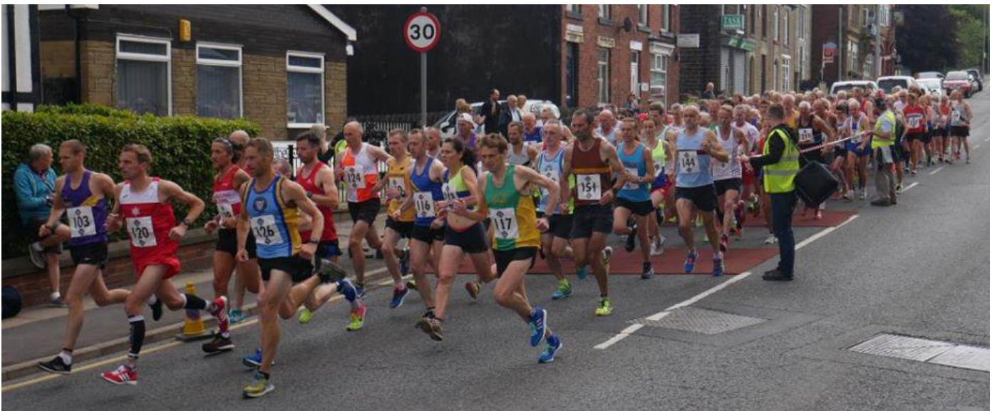
Start of the race